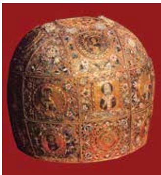
St. Blaise Crown